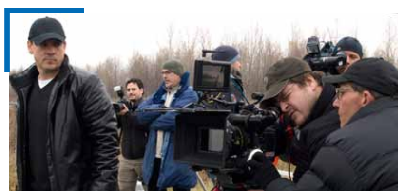
The actor, Claude Legault, surrounded by the Les Sept Jours du Talion film crew, by Podz.